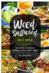
Image Alt Text: A tantalizing spread of gourmet dishes, including a succulent steak, a savory pasta dish, and a decadent chocolate cake.