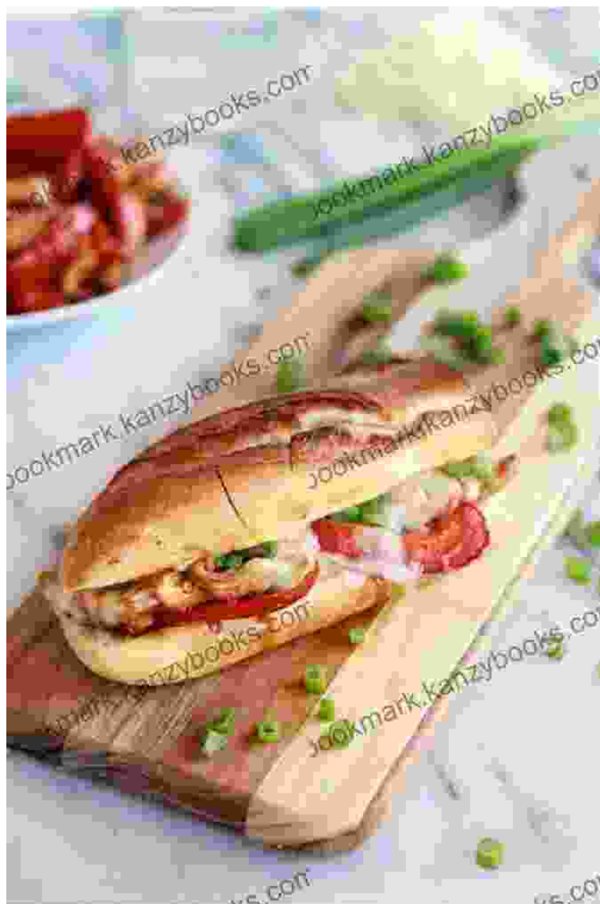
Teriyaki Chicken Panini

Beyond the classics, "Recipes From America's Favorite Panini Bar" ventures into the realm of culinary innovation, introducing a tantalizing array of unexpected and tantalizing flavor combinations. From the Asian-inspired Teriyaki Chicken Panini to the decadent Truffle Mushroom Melt, each creation is a testament to the boundless possibilities of the panini.