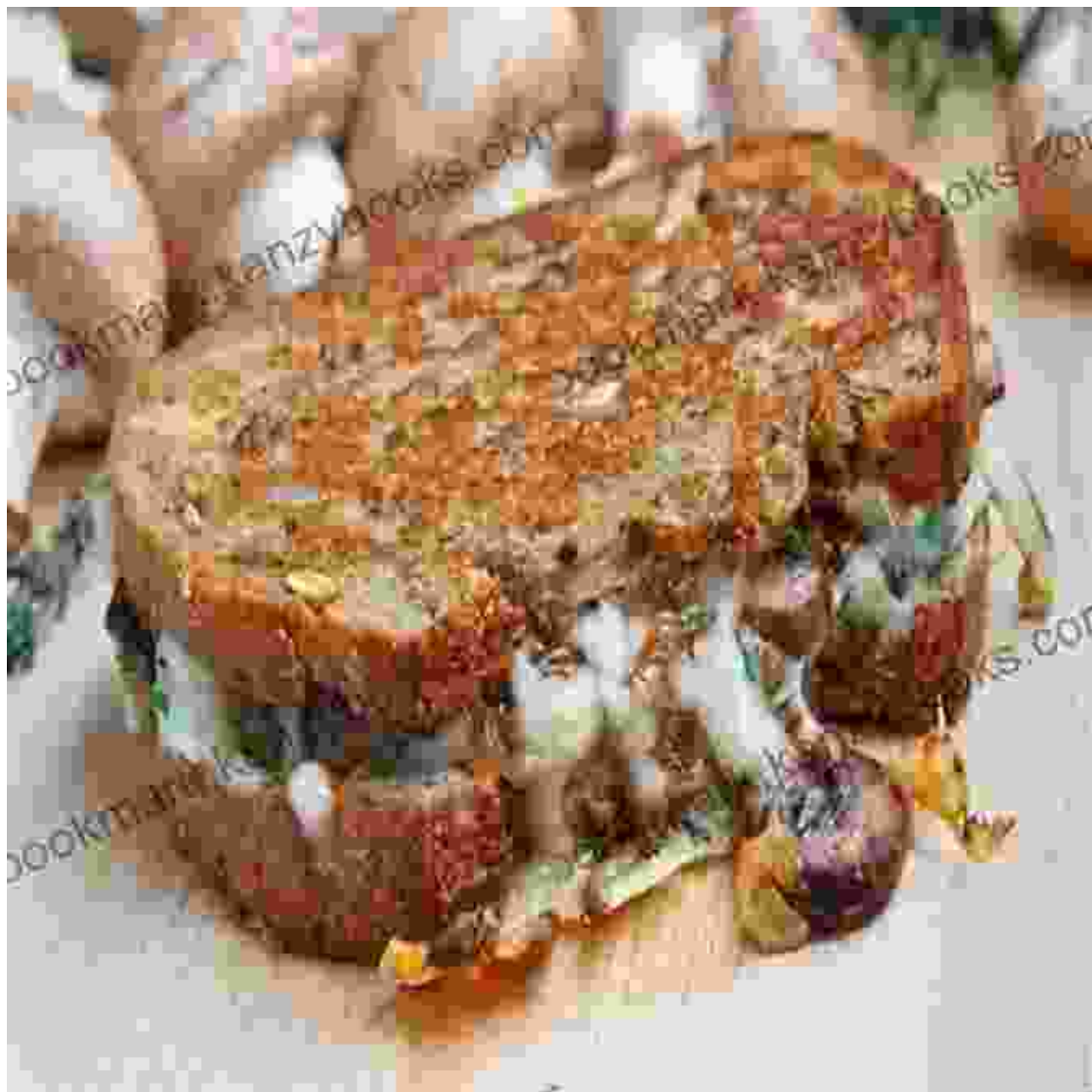
Truffle Mushroom Melt

A harmonious fusion of East and West, the Teriyaki Chicken Panini marries tender chicken glazed in a sweet and savory teriyaki sauce with crunchy Asian slaw. A drizzle of spicy mayo adds a tantalizing kick to this innovative delight.