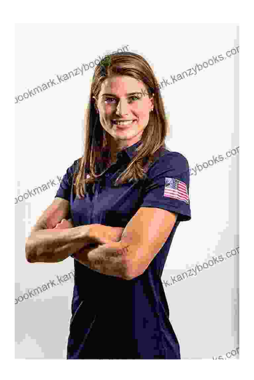
A Web of Deception

Along her journey, Sarah encounters a cast of intriguing characters, including her enigmatic coach, suspicious teammates, and a charming stranger who seems to hold the key to her past. As the stakes rise and secrets unravel, Sarah must confront her inner demons and overcome seemingly insurmountable obstacles.